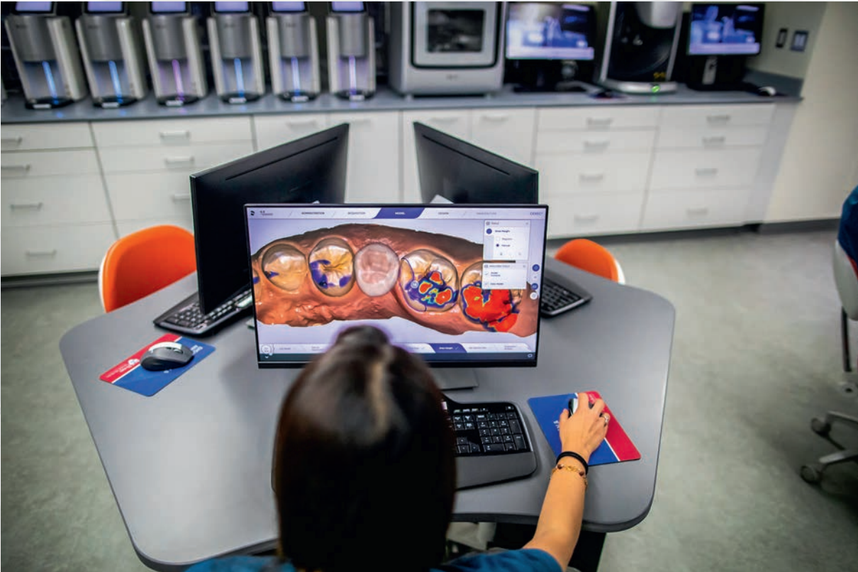
Dental students at the university are required to gain an in-depth experience with CAD/CAM technologies, and they happily embrace digital tools.

a true benefit for our patients and have at least some scientific support.