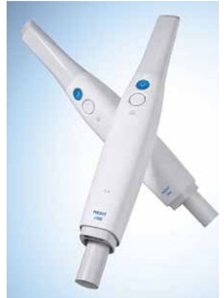
• The new i700 wireless intraoral scanner.

For more information about Medit products and software, visit Medit’s official website, www.medit.com .