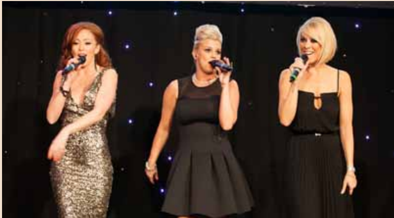
Atomic Kitten sing at the ball