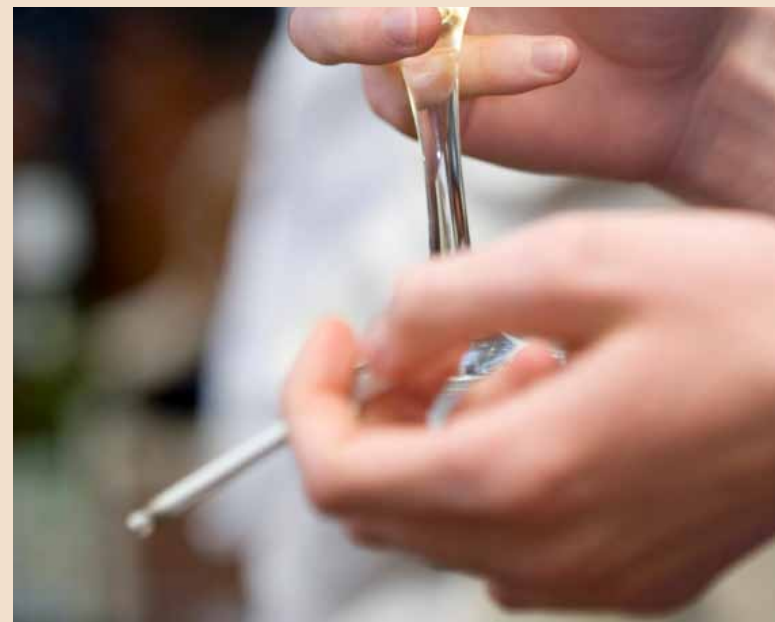
Research shows female smokers risk for tooth loss

"We found that heavy smokers had significantly higher odds of experiencing tooth loss due to periodontal disease than those who never smoked," explains Mai. "We also found that the more women smoked, the more likely they experienced tooth loss as a result of periodontal disease." DT