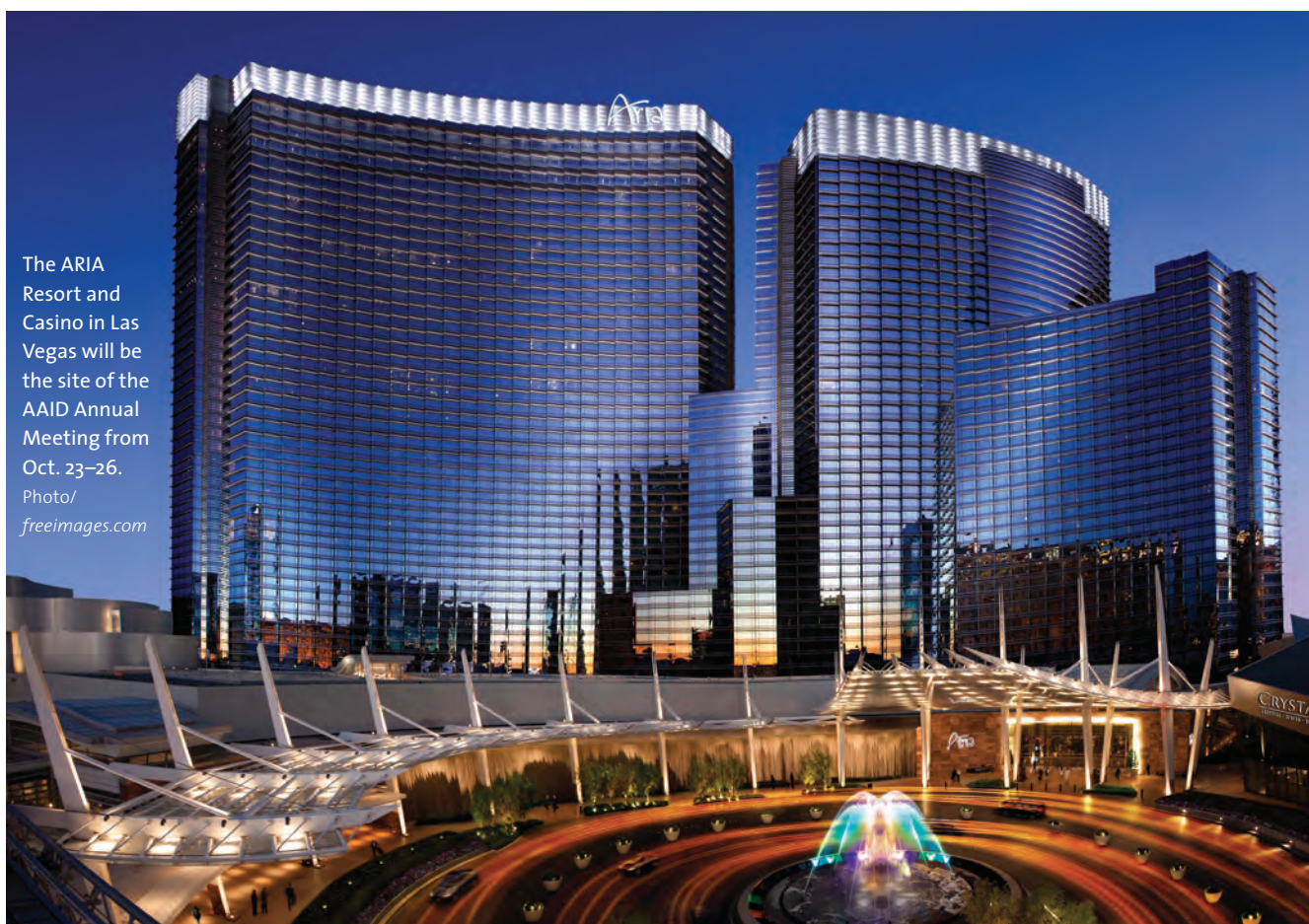
The ARIA Resort and Casino in Las Vegas will be the site of the AAID Annual Meeting from Oct. 23-26.

68th AAID Annual Meeting aims to offer quality C.E., fresh perspectives and time to network