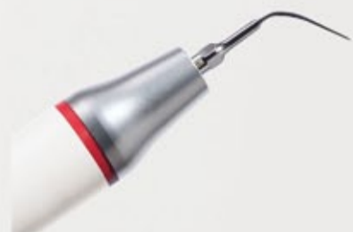
> Original Piezon Handpiece LED with EMS Swiss Instrument PS

Virtually no pain for the patients and extra-gentle on the gingival epithelium: maximum patient comfort is the decisive plus brought by the state-of-the-art Original Piezon Method. Not to mention the uniquely smooth tooth surfaces. These extra benefits are the result of linear oscillating action aligned with the tooth surface delivered by the Original EMS Swiss Instru-