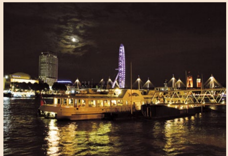
Partygoers had a night to remember on the Silver Sturgeon

For more information about Smile-on and its healthcare education programmes please call 020 7400 8989 or email info@smile-on.com . DT