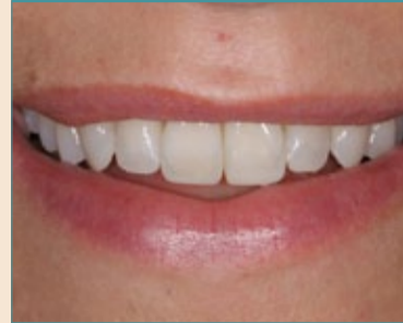
ABB not ABC Tif Qureshi details the latest treatment sequence