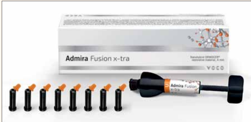
Admira Fusion x-tra has a 4 mm depth-of-cure for fast, long-lasting posterior restorations and is available in one universal shade. Its nano-particulate enhances its ability to adapt and blend to surrounding tooth structure.

This unique “pure silicate technology” offers several advantages, including up to 50 percent lower polymerization shrinkage (1.25 percent by volume) than today’s conventional composites, as well as up to 50 percent lower shrinkage stress. These are two key physical properties in bulk-fill restoratives. Admira Fusion x-tra has a 4 mm depth-of-cure for fast, long-lasting posterior restorations and is available in one universal shade. Admira Fusion’s nano-particulate amplifies its chameleon effect, enhancing its ability to adapt and blend to surrounding tooth structure compared to conventional composites, according to the company.