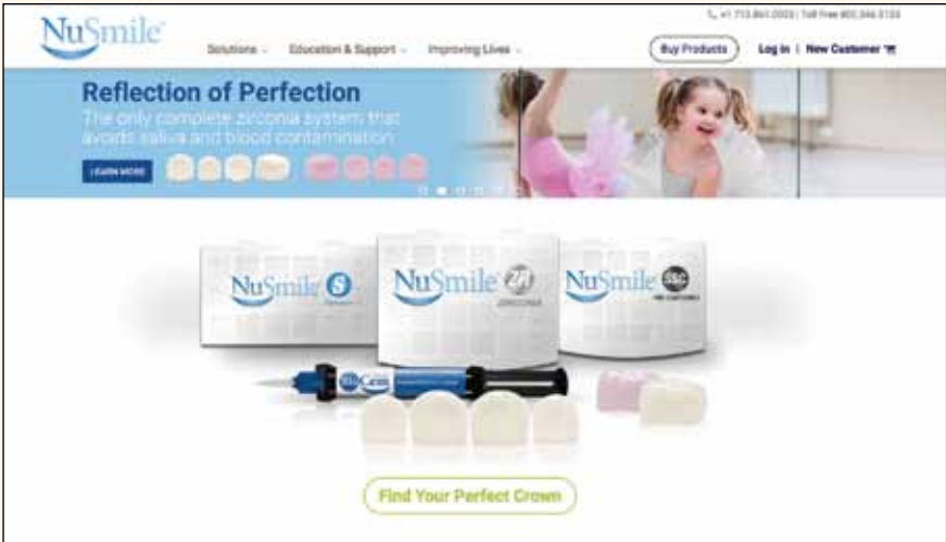
Changes to the NuSmile website include the availability of more information about NuSmile solutions in pediatric esthetic restorative dentistry. The site also has added capabilities that make it easier to connect with the company.