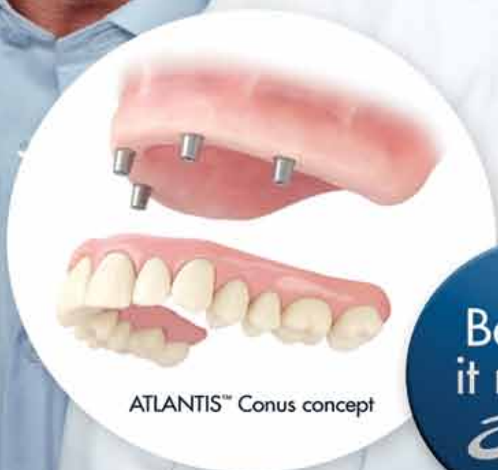
ATLANTIS™ Conus concept