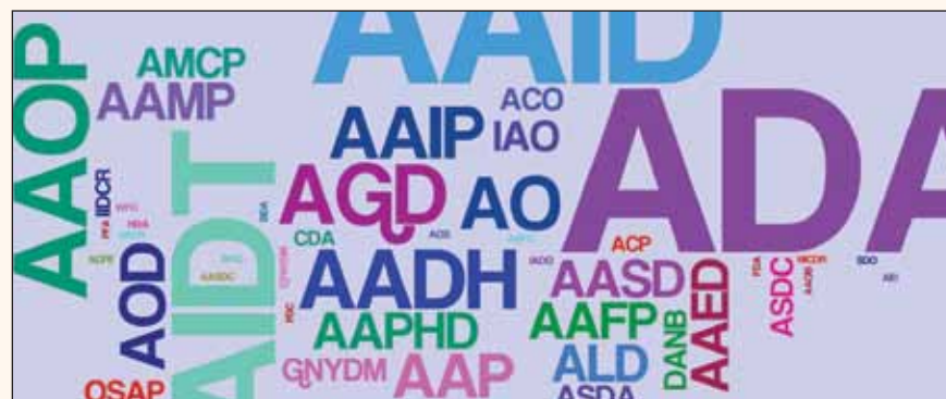
Dental Tribune graphic created at www.wordle.net

We are running out of letters to distinguish the plethora of dental organizations. A rebus should represent a meaning, or a riddle perhaps. The ADA, for example, stands for American Dental Association. But, it could also represent the American Dermatological Academy.