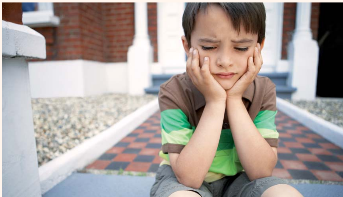
Despite more children in the UK suffering from dental problems, many have never been taken to a dentist.

Among its findings are that only a quarter of the children of the parents