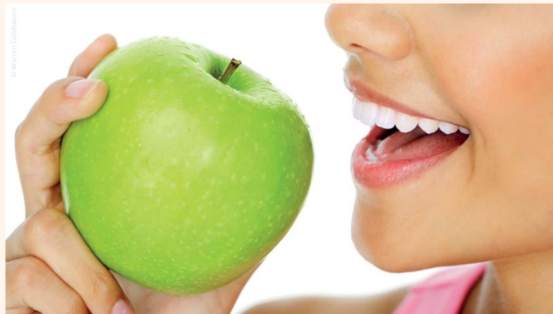
Patients tend to overestimate the functionality of implants, new research has shown.

The study, titled "Public perceptions of dental implants: A qualitative study", was published online on 8 May in the Journal of Dentistry .