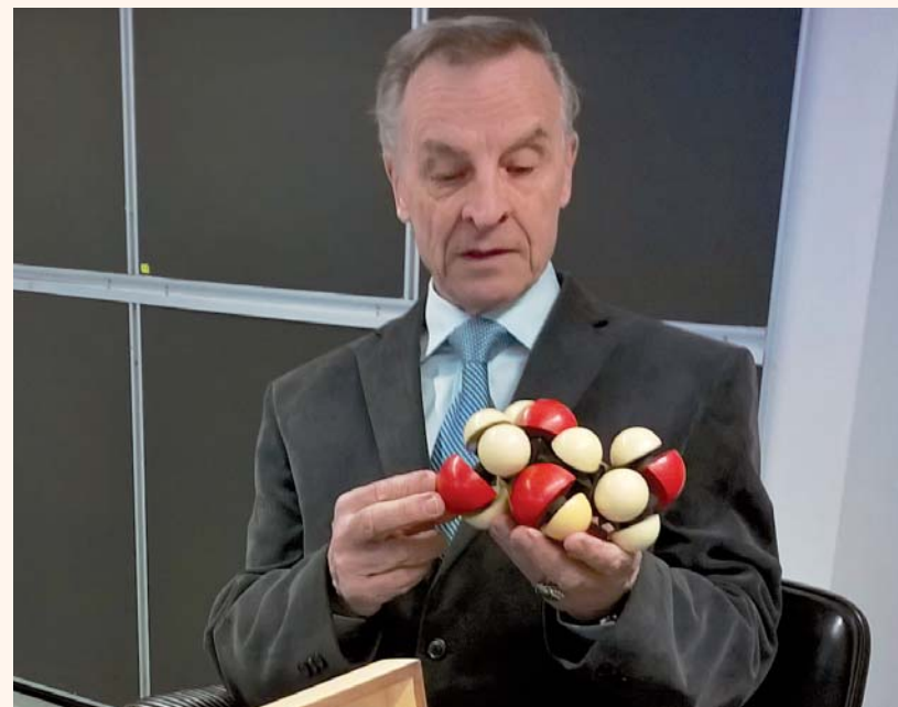
Professor Emeritus Kauko K. Mäkinen posing with a model of the xylitol molecule.

Regular consumers who use xylitol for dental purposes have no side effects. If somebody accidentally consumes larger single doses, for example, 20–30 grams, some individuals may have transient diarrhoea. However, sorbitol, mannitol and common milk causes much more severe symptoms. Of course, small children must use xylitol gum under parental guidance.