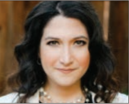
Randi Zuckerberg, an entrepreneur, investor, bestselling author and media personality, is featured at the ‘Celebrity Luncheon’ at noon on Monday, Nov. 28, during the six-day GNYDM, which this year runs from Nov. 25–30.