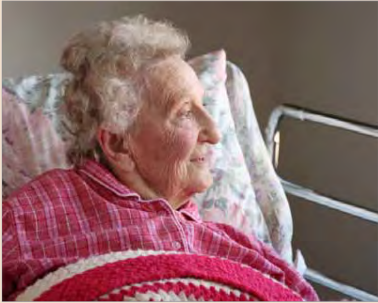
Patients are facing cancer alone

One in four (25 per cent) of the 325,000 newly diagnosed cancer patients in the UK - an estimated 70,000 patients each year - lack support from family and friends during their treatment and recovery, according to new research published by Macmillan Cancer Support. A third of those (seven per cent) - an estimated 20,000 people each year - will receive no help whatsoever, facing cancer alone.