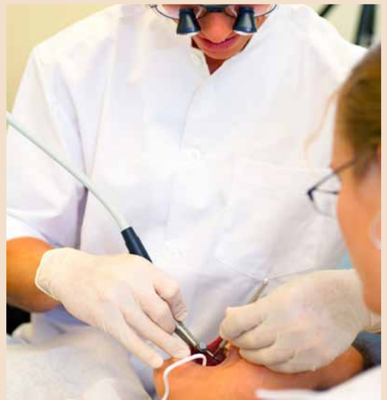
Graduates can work in a variety of practices

Anyone interested in applying for the Regional Dentist Programme can contact the IDH resourcing team online or on 0845 647 7364.