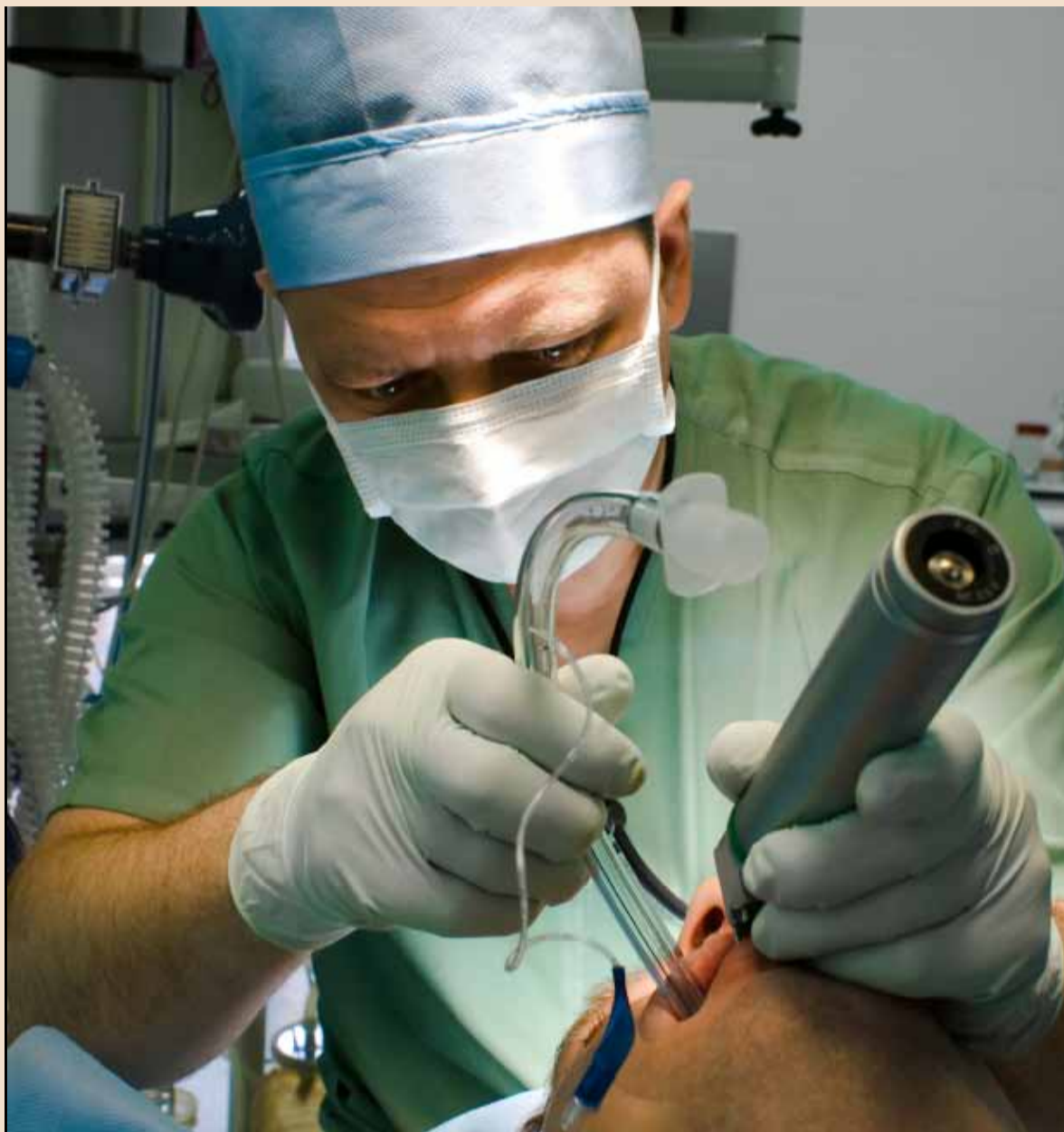
Can graduates follow the 'traditional' career pathway?