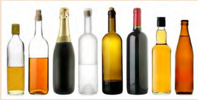
Do you know your intake?

Some people could be underestimating their alcohol intake by as much as 40 per cent, according to new figures the Department of Health have published.