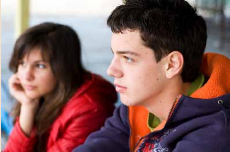
Boys should be vaccinated

The Throat Cancer Foundation has called for a new vaccine for boys to prevent a throat cancer epidemic.