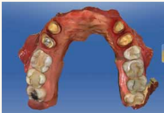
Fig. 3: A digital impression is taken using the CEREC Omnicam (Sirona Dental Systems Inc., Charlotte, N.C.). This occlusal view illustrates how precisely the Omnicam captures a full-color digital impression.

As this case illustrates, digital impressions are not just limited to final restorations, and certainly not just to single units. It's time for you to take a closer look at digital restorative technologies and see how they can benefit your practice and your patients.