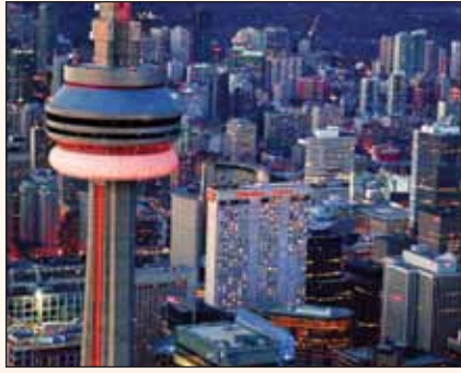
The Toronto Academy of Dentistry Winter Clinic, Friday, Nov. 14, has a new home: the Toronto Sheraton Centre in the heart of downtown Toronto.

The 77th Annual Winter Clinic is on the move, with its 2014 meeting day scheduled for Friday, Nov. 14, at the Toronto Sheraton Centre.