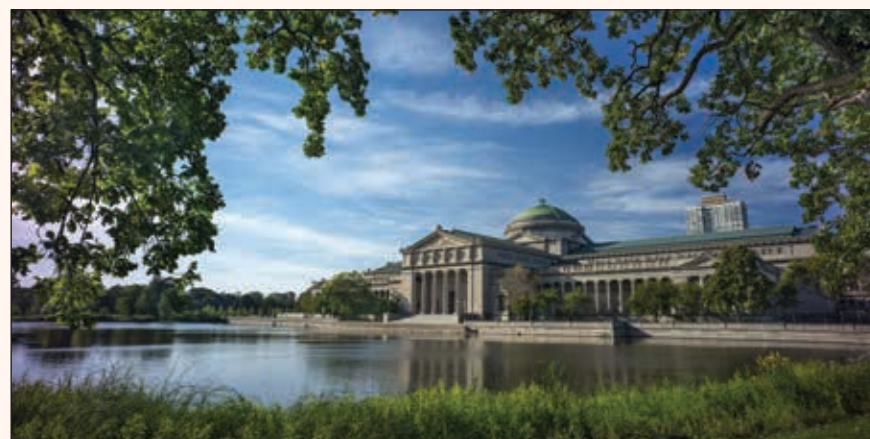
Museum of Science and Industry, Chicago building (south view) is hosting the Sunstar Welcome Reception at AAPD19.

The Sunstar Welcome Reception will be held at the Museum of Science and Industry, in Chicago's historic Hyde Park neighborhood. Attendees will be able to meet