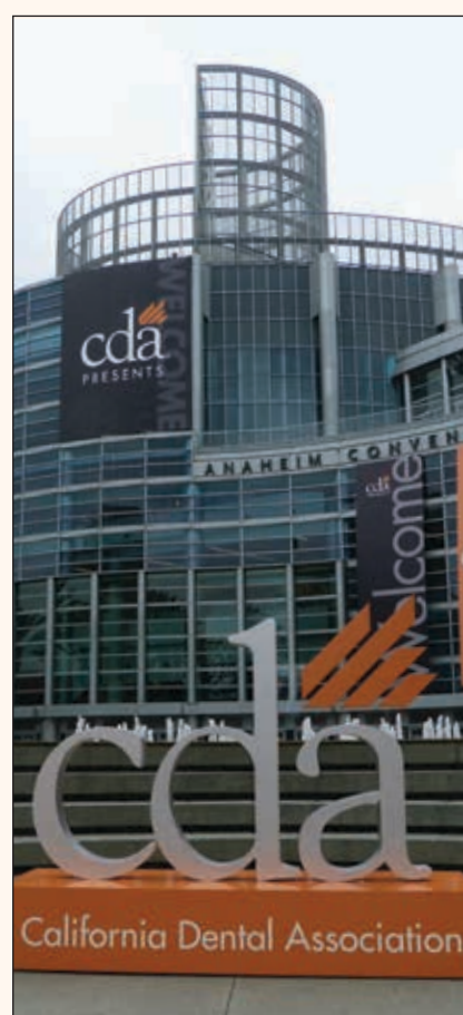
The Anaheim Convention Center is the host site of CDA Presents The Art and Science of Dentistry, May 16-18, in Anaheim, Calif.