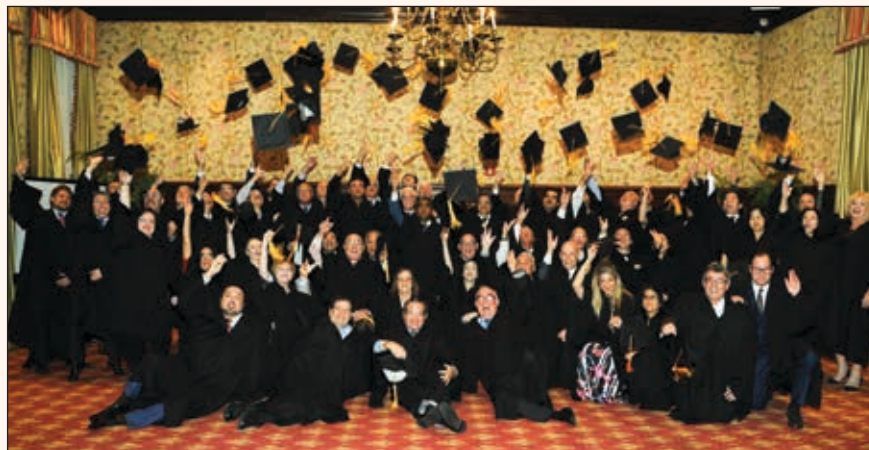
New IADFE fellowship inductees toss mortar boards into the air at the 2018 IADFE meeting. The 2019 induction is once again being held in conjunction with the Greater New York Dental Meeting, on Monday, Dec. 2.

This year's annual induction meeting will be once again in conjunction with the Greater New York Dental Meeting, on Monday, Dec. 2. The guest presenter will be American Dental Association President