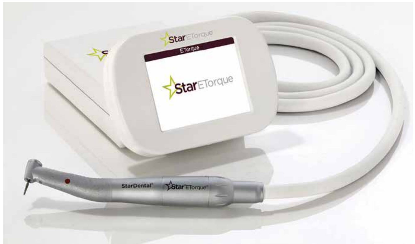
• The StarETorque customizable electric system.