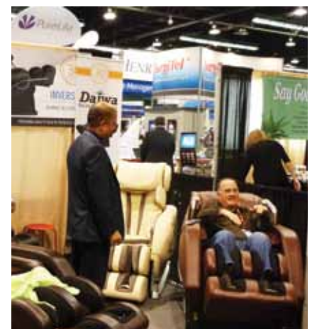
• Need a quick break from walking around these exhibit aisles? For a minute or two of relaxation, stop by booth No. 1685 to experience Daiwa's Zero Gravity Chair or its chairs offering full-body massage with heat.