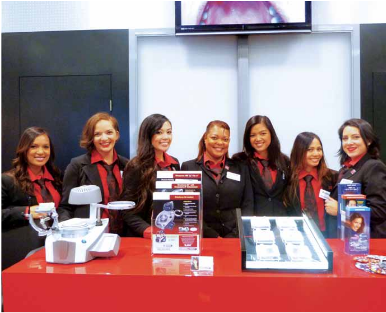
• The team at Glidewell is ready to answer all your questions at booth No. 354.