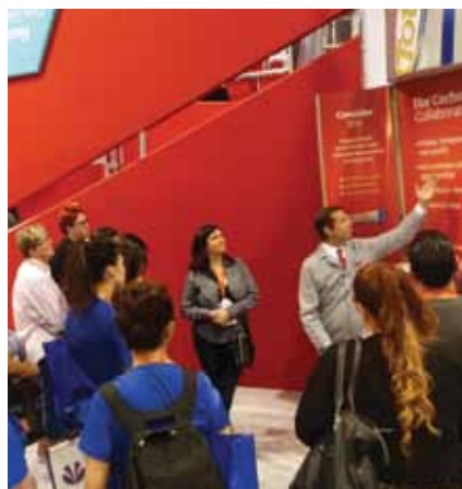
• A group of dental students learn all about Colgate at booth No. 1316.