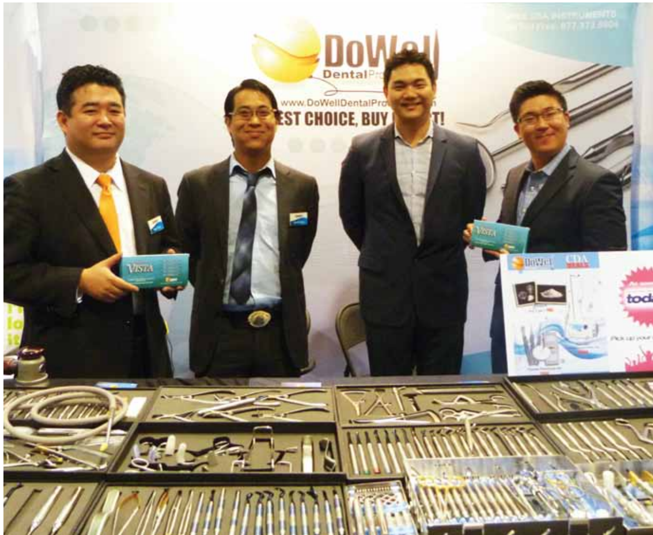
• Go see the team at DoWell, booth No. 1677, to learn about the company's high-end tools and speedy delivery.