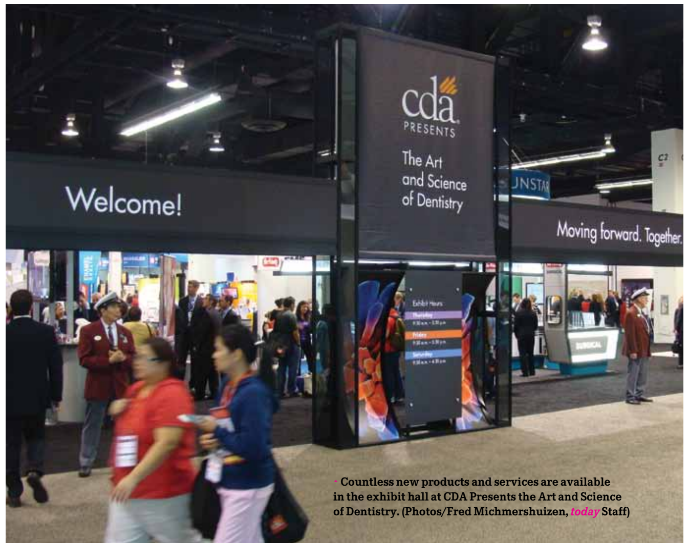
Countless new products and services are available in the exhibit hall at CDA Presents the Art and Science of Dentistry.