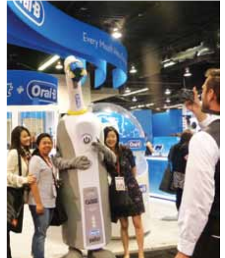
• Stop by the Crest Oral-B booth, No. 1106, to take some selfies with a human-sized toothbrush.