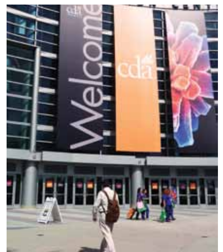
• CDA attendees head into the Anaheim Convention Center Thursday morning.