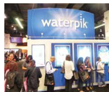
• Attendees line up to attend the WaterPik demonstration at booth No. 1116 where watching a 7-minute video means receiving a free special edition WaterPik!