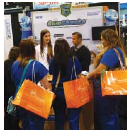
• Dental students learn an easy way to floss with braces in less than two minutes at GumChucks, booth No. 1677.