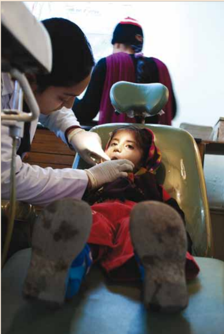
All treatments supplied to patients is free

Dental Tribune interviews the founders of the Pain Relief Clinic in Hansali