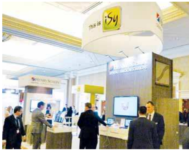
The Henry Schein Surgical Solutions booth.