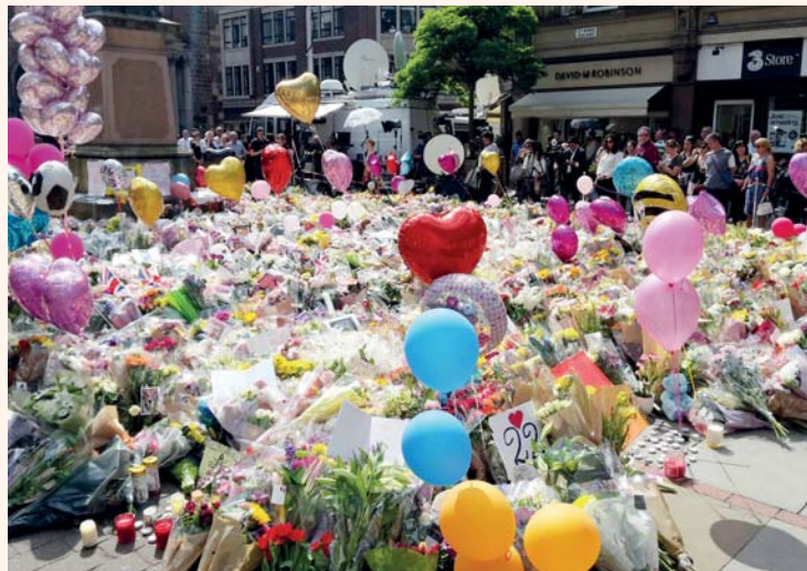
Floral tributes at St Anns Square in Manchester. The attack has left 22 people dead and over 50 injured.

"Quite rightly Manchester has resolved to carry on. Our thoughts are with all the families touched by this atrocity," he added.