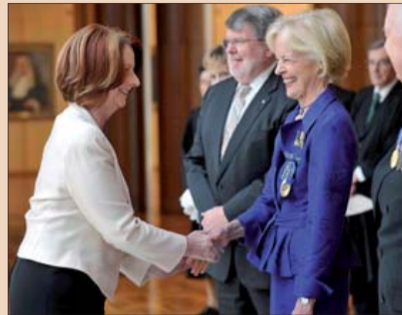
Prime Minister Julia Gillard (left) greeting members of the new Parliament.

After two weeks of political deadlock, Labor recently regained power by winning support