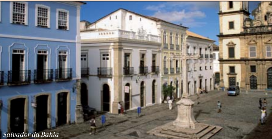
Salvador da Bahia