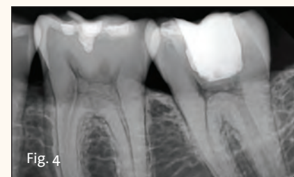
Fig. 4: Final radiograph.

tive prevention and education. Bulk-fill composite is an invaluable “direct, one-appointment” option for posterior restorations because it offers a high depth of cure for quick and confident placement, but doesn’t sacrifice any of the other im-