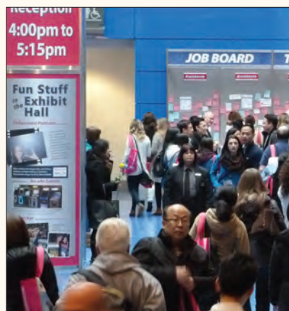
Attendees enter the exhibit hall on opening morning at the 2018 PDC.

PDC After Hours takes place Friday evening and late into the night at Vancouver's legendary Commodore Ballroom, featuring the Famous Players Band, widely recognized as Vancouver's best live band because of the way they change the way people experience live music. The $25 (plus GST) cost includes two drinks, dinner and the live dance band. Guests must be at least 19 and have valid ID.