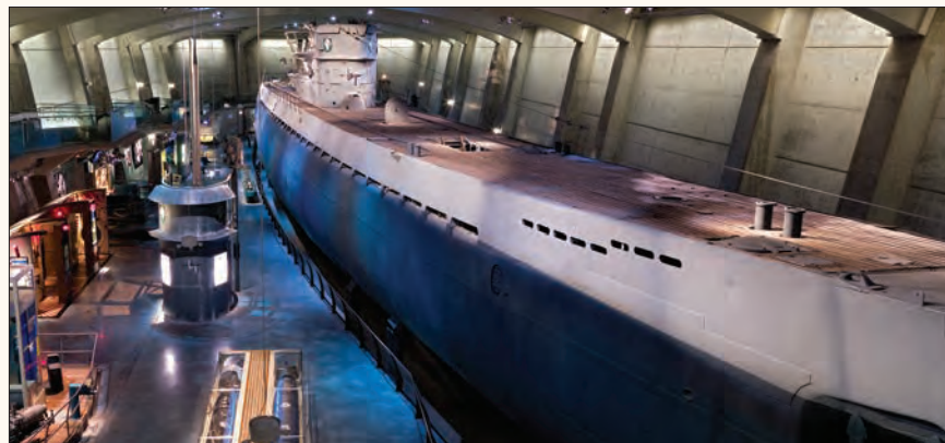
The AAPD 2019 Welcome Reception at Chicago's famed Museum of Science and Industry will feature emersive exhibits open to attendees, including the chance to tour a German U-505 submarine captured during World War II.