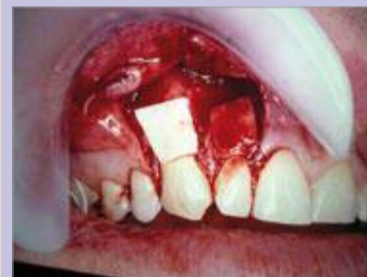
Fig. 3: The GTR membrane was shaped and placed over the root surfaces of teeth #6 and #7.