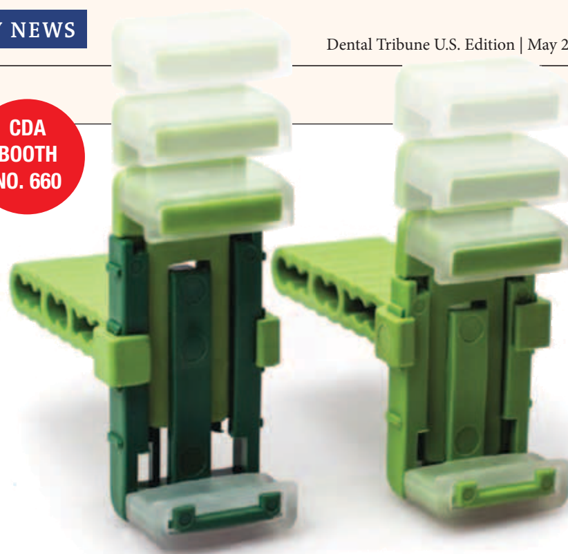
The Sensibles universal sensor positioner (large and medium sizes pictured) now feature unique locking bumpers that enable you to slide the bite block to any of several fixed positions.