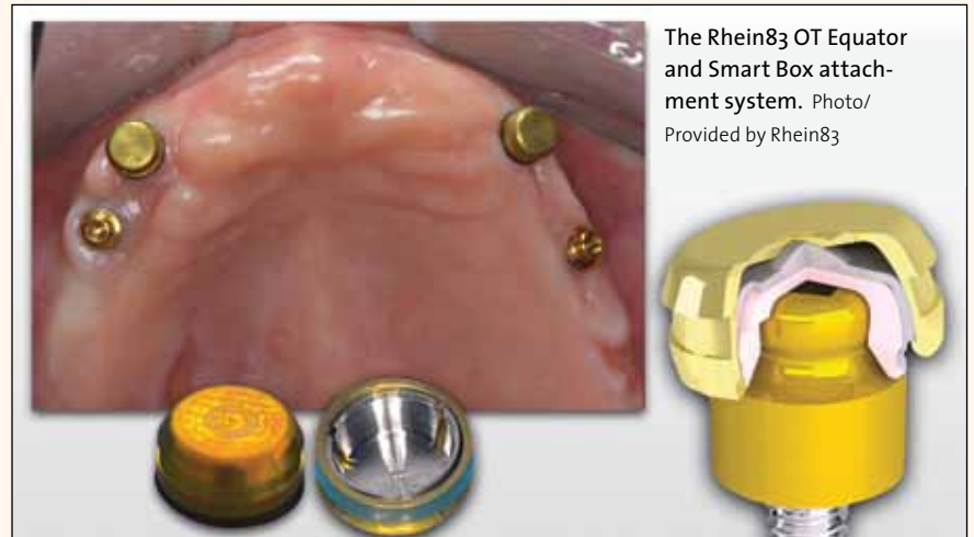
The Rhein83 OT Equator and Smart Box attachment system.