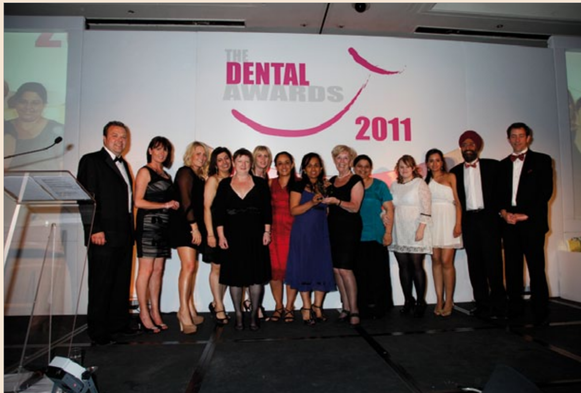
Team of the year - Sweetcroft Dental Care

Winners announced for national dental competition