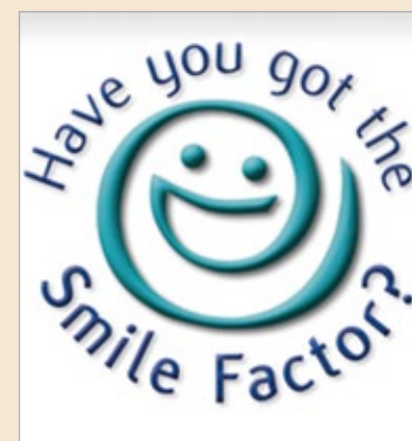
The National Smile Month logo 2011

"Remember, having the Smile Factor can improve your confidence, your attractiveness and your general health - so don't underrate it!" DT