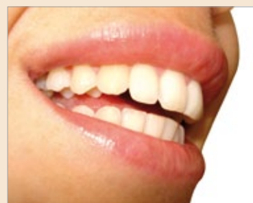
Smiles topped attractiveness polls

"During National Smile Month, we hope everyone will consider what they can do to improve their Smile Factor. Hundreds of dental practices across the UK will be supporting the campaign and it's an excellent time to seek their help and advice. DT