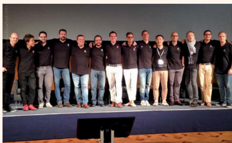
About 300 participants from all over the world attended the second annual Bio-Emulation colloquium in Berlin last month.