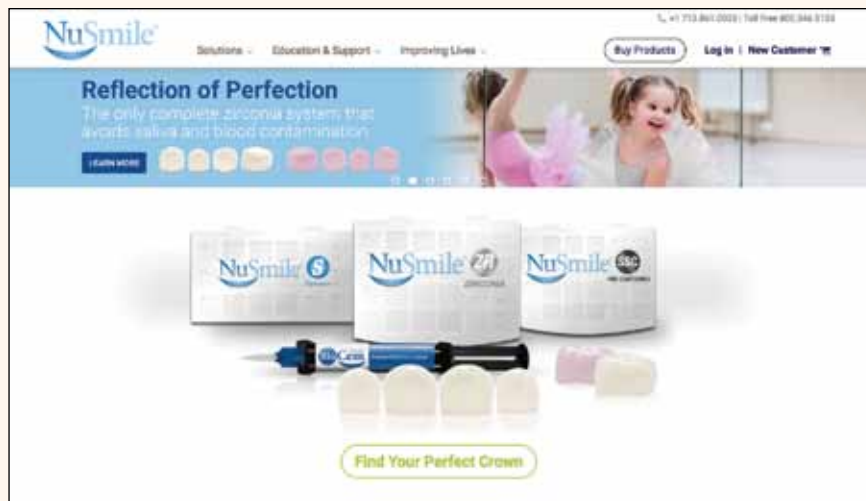
Changes to the NuSmile website include the availability of more information about NuSmile solutions in pediatric esthetic restorative dentistry. The site also has added capabilities that make it easier to connect with the company.