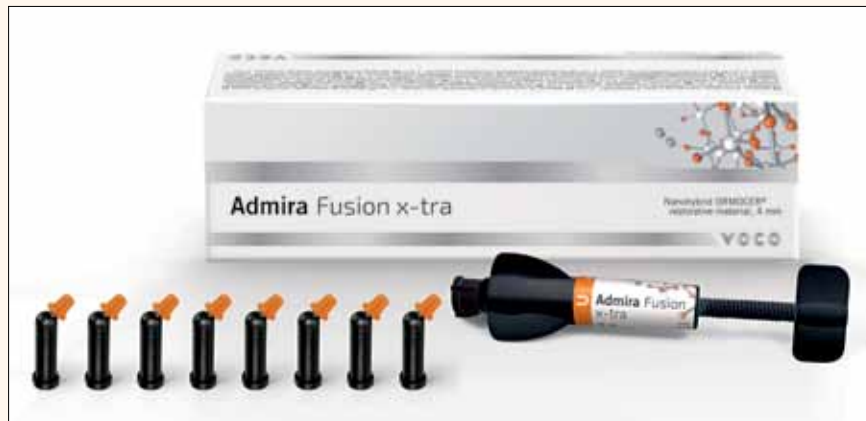
Admira Fusion x-tra has a 4 mm depth-of-cure for fast, long-lasting posterior restorations and is available in one universal shade. Its nano-particulate enhances its ability to adapt and blend to surrounding tooth structure.

Admira Fusion’s nano-particulate amplifies its chameleon effect, enhancing its ability to adapt and blend to surrounding tooth structure compared to conventional composites, according to the company.