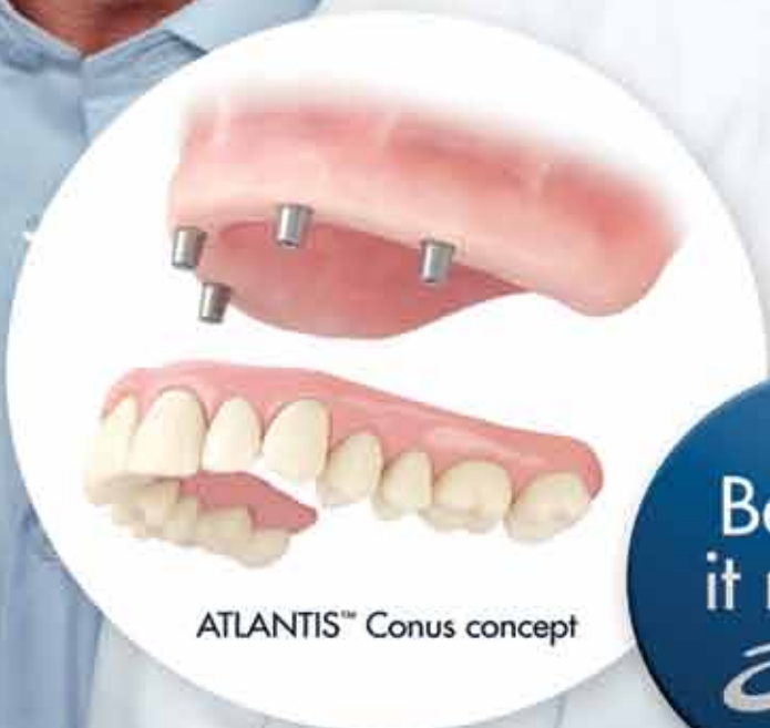
ATLANTIS™ Conus concept