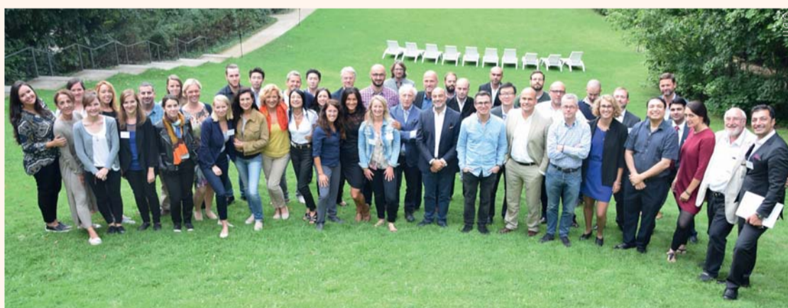
More than 30 publishers from around the globe joined this year's Annual Publishers' Meeting in Berlin.

Over the past 13 years, the DTI publishing network has grown significantly. Today, DTI reaches over 650,000 dental professionals in 25 different languages in about 90 countries around the globe. At the meeting in Berlin, the group welcomed two new partners, from Israel and Iran, who will be publishing their respective localised versions of the Dental Tribune newspaper and providing updates on their particular market on local websites on www.dentaltribune.com .