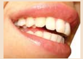
Dentist calls for stop on 'salon' whitening treatments

• Ann Keen Secretary of State for Health in July 2007 confirmed that government supports the GDC position that Tooth Whitening is the Practice of Dentistry: 25 July 2007 : Column 1208W [R] [152011] http://www.publications.parliament.uk/p...3w0006.htm