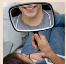
Being happy with your teeth can impact a person's confidence

said that the expense is the main reason for not visiting the dentist regularly. Although three in ten people have landed themselves in debt or had to make sacrifices in order to cover unexpected dental bills, only one in ten people has dental insurance. [1]