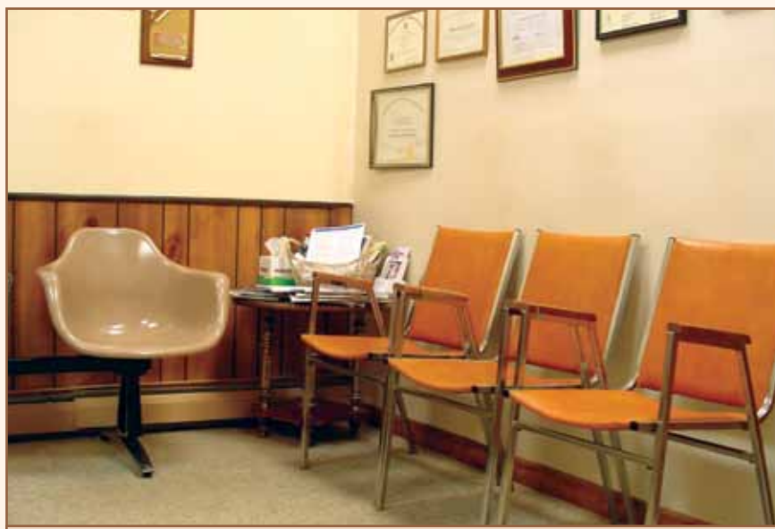
Could an outdated and uncomfortable waiting room be one of the reasons why new patients don't ever book a second appointment with your office?

Whatever, the reason(s), you will likely never know exactly why patients walk away from your practice. They just disappear, leaving you to absorb the ongoing financial fallout.