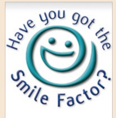
The National Smile Month logo 2011

"Remember, having the Smile Factor can improve your confidence, your attractiveness and your general health - so don't underrate it!" DT