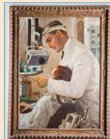
The Dentist 1929 by Sir John Lavery