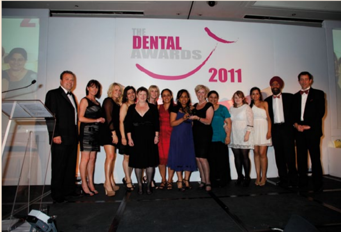
Team of the year - Sweetcroft Dental Care

Winners announced for national dental competition