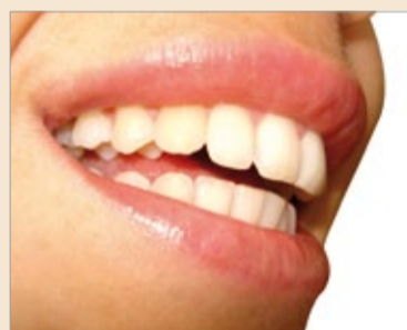
Smiles topped attractiveness polls

"During National Smile Month, we hope everyone will consider what they can do to improve their Smile Factor. Hundreds of dental practices across the UK will be supporting the campaign and it's an excellent time to seek their help and advice. DT