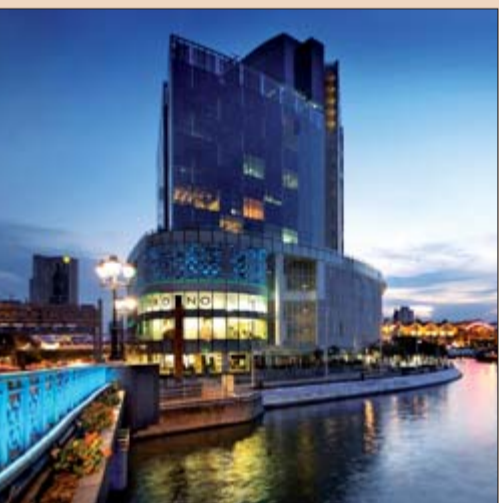
AmannGirrbach's new office as seen from the Coleman Bridge in central Singapore.

The new Singapore branch will support Amann's distribution partners in both regions through logistics and responsive customer service, the company said. It also announced plans for a help desk and company training centre to be established by the end of the year.