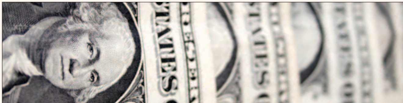
A 2014 report put health-care businesses' average annual losses to fraud at $175,000 per practice.

• Removing cash from the daily deposit. If your practice accepts cash for copayments and other charges, an employee could take some of this cash and hope not to be detected. Warning signs that this might be happening generally come in the form of patient complaints when they're being billed for something they've already paid for. You can help prevent this type of theft by blocking staff access to any means that could al-