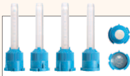
New T-MIXER tips are designed to reduce material waste, improve efficiency and lower costs.