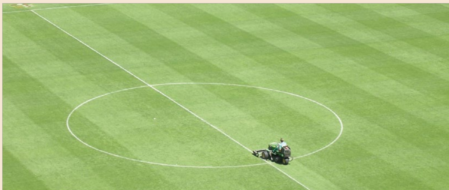
Since the inception of the NHS, dentistry has always been used as a political football

Of course since the inception of the NHS, dentistry has always been used as a political football where successive governments have incentivised clinical choices they deem favourable. However in incentivising access over quality, while high-need patients are able to be seen for dental treatment (according the DH), for me the jury is out as to whether they are getting the treatment that best meets their needs. DT