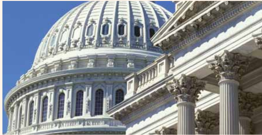
Financial services reform legislation being debated in Washington could hurt dental practices, according to the ADA and other dental associations.

As currently written, the Restoring American Financial Stability Act of 2010 would subject health care providers who regularly charge interest on outstanding bills or allow patients to pay in installments to federal scrutiny.