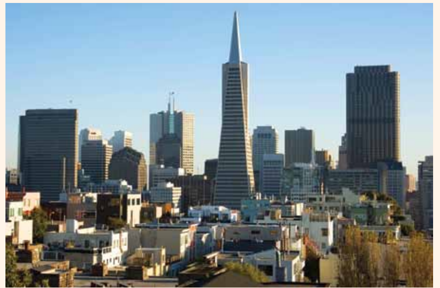
The city of San Francisco hosts the IACA Conference from July 30 to Aug. 1. You can register for all lectures and workshops online at www.TheIACA.com. → IACA Conference, pages 10A & 11A