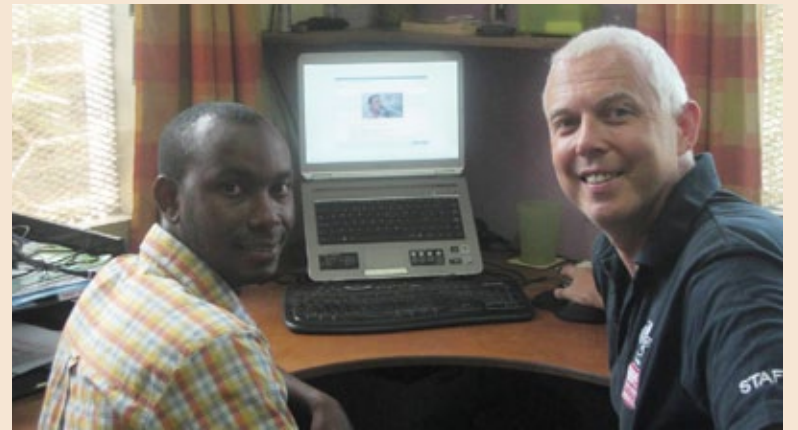
Smile-on products are put into practice with positive results

'The Key Skills format was invaluable for the professional development of our clinical team and allowed them to stay focussed on the policies and procedures required in their clinical practice.'