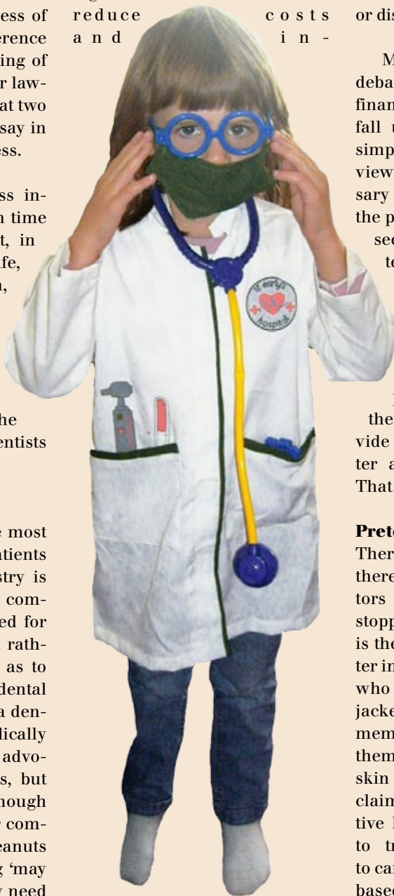
Is this a dentist or a doctor? You decide

But exactly how far are we meant to take this? Should those dentists using this title really pay out for redoing their advertisement, letter headed papers, etc, etc, etc? Throughout the UK, private and public sector companies are taking active measures to reduce costs and