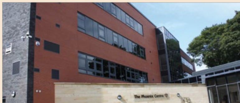
Patients no longer need to travel to hospitals thanks to the new CATS!

The CATS service will be used for patients over 18 on the condition that they are registered with a local GP; patients who have severe symptoms which may suggest a more serious health condition may still be referred to hospital, as they may require specialist medical care. DT