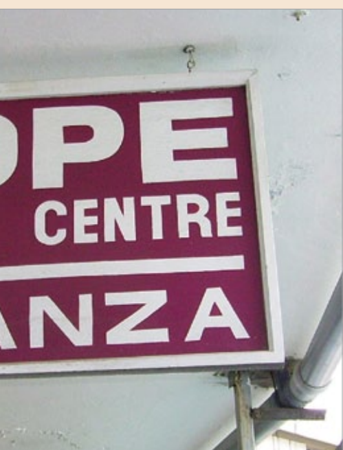
second city of Tanzania