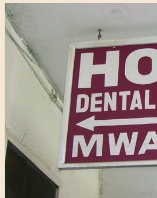
A sign of Hope for dental patients in Mwanza, the

Even though we had the struggles of computer hardware not being available in the clinic and we often needed to do our training on laptops, we were still able to use these excellent resources for the training of the clinical team. At one stage Ian had the opportunity to speak