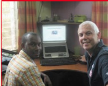
Smiles all round Bridge2Aid share their education experience with Smile-on