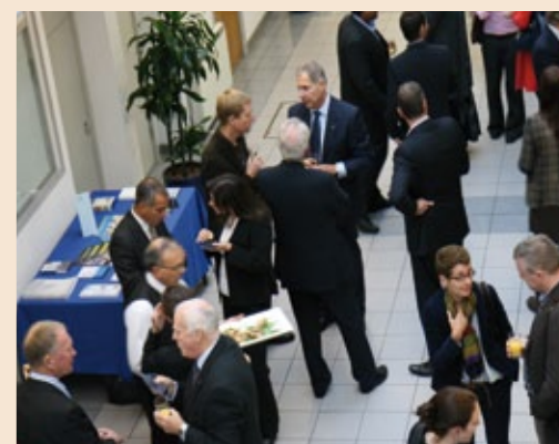
The new office is based at the Cardiff Medi-centre