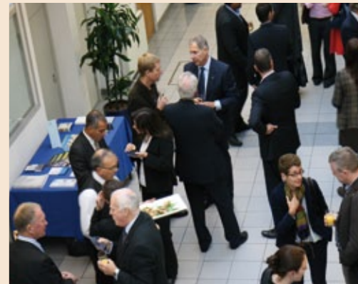
The new office is based at the Cardiff Medi-centre