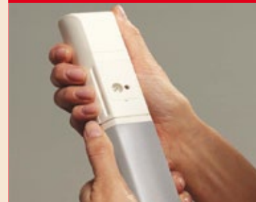
A breath of fresh air Dental Tribune tests the Cleanaer purification device