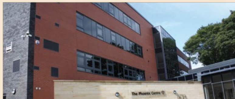
Patients no longer need to travel to hospitals thanks to the new CATS!

The CATS service will be used for patients over 18 on the condition that they are registered with a local GP; patients who have severe symptoms which may suggest a more serious health condition may still be referred to hospital, as they may require specialist medical care. DT