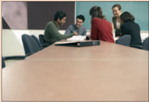
Scottish dental students are urged to stay put

Graduate dentists at a new dental school in the north east of Scotland are being offered incentives to remain in the area and practise as NHS dentists.