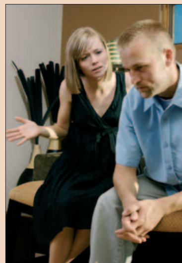
Don't forget to log the complaints

they seek assurances that steps have been put in place to stop the same thing happening again.'