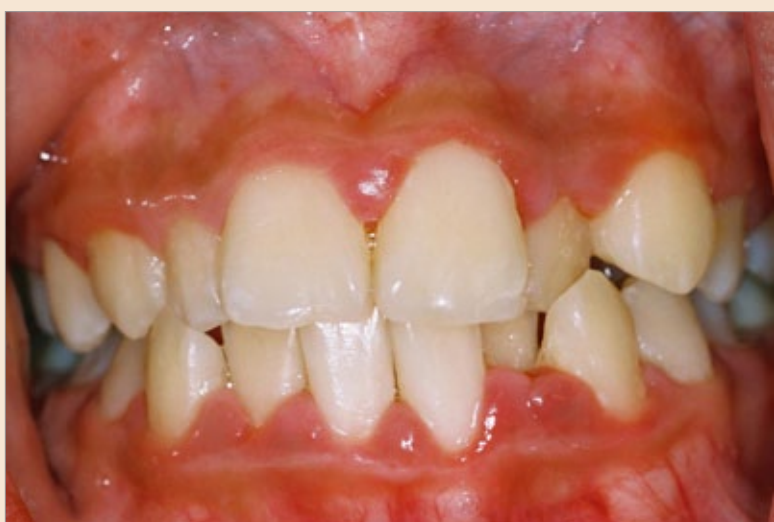
Poor dental hygiene can provide bacteria with a route into the bloodstream according to this latest research by the University of Bristol and RCSI in Dublin