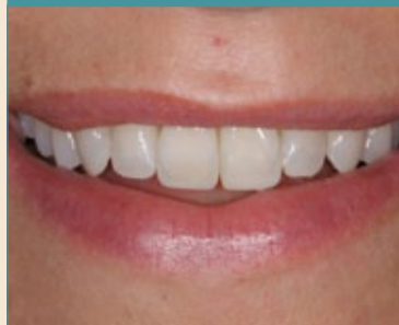
ABB not ABC Tif Qureshi details the latest treatment sequence