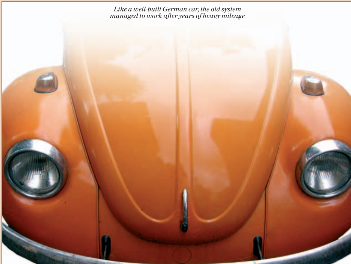
Like a well-built German car, the old system managed to work after years of heavy mileage