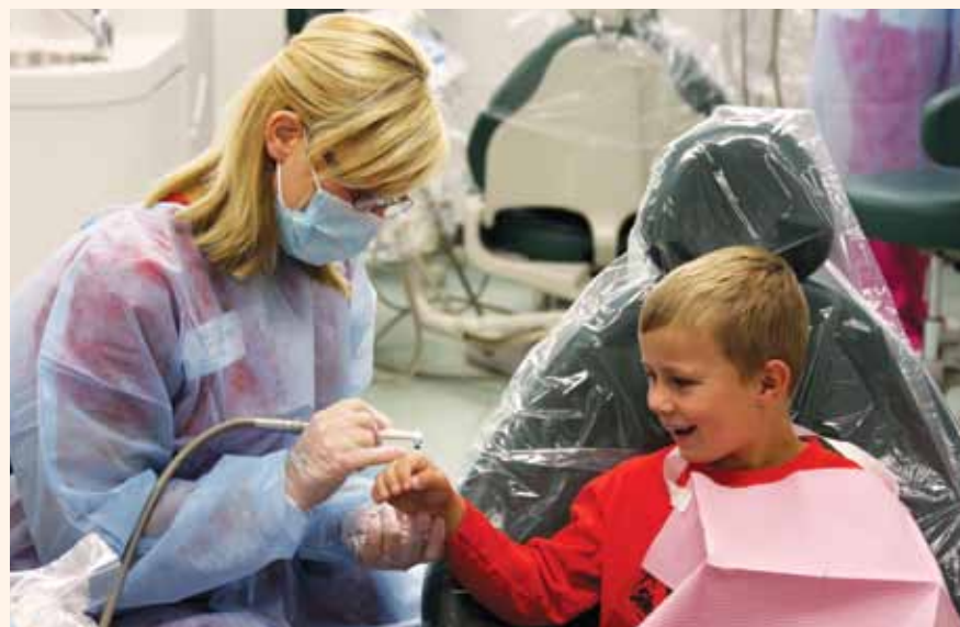
Hu-Friedy dental supplies will aid in the expansion of Howard University's pediatric oral health outreach programs in and around Washington, D.C.

such as Hu-Friedy make it possible for NCOHF affiliates to give underserved children the comprehensive care they deserve." ■