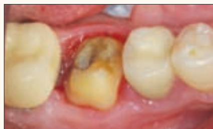
Fig. 1: Self-adhesive feature means no etching, priming or bonding of prepared dental surfaces.