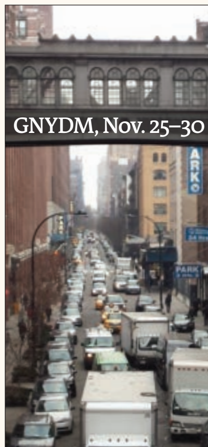
Enjoy a four-day exhibition hall with more than 700 exhibitors, top presenters from across the world and the sights and sounds of one of the world's most fascinating cities — all at the 2016 Greater New York Dental Meeting. Above, looking down West 15th Street from the High Line.