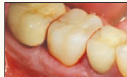
Fig. 4: Kind to the gingiva, even deeper subgingival margins.