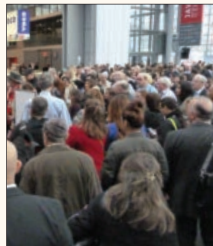
Under the glass ceiling in the Jacob K. Javits Convention Center, attendees at the 2015 GNYDM stream into the exhibit hall on the first morning of the meeting's four days of exhibits.