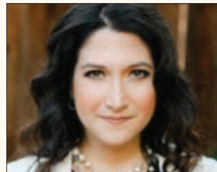
Randi Zuckerberg, an entrepreneur, investor, bestselling author and media personality, is featured at the 'Celebrity Luncheon' at noon on Monday, Nov. 28, during the six-day GNYDM, which this year runs from Nov. 25–30.