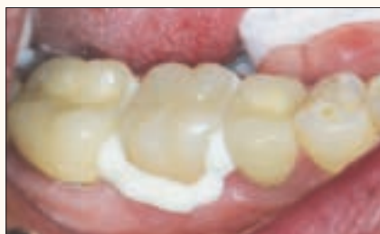
Fig. 2: Bonds to most substrates, including zirconia restorations, without the need for separate chemical primers.