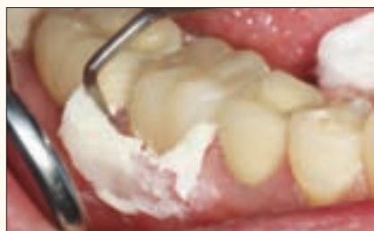
Fig. 3: Easy to clean up with hand instruments and floss.