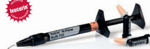
Tetric® N-Flow Bulk Fill flowable