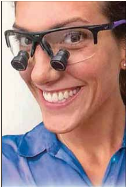
Left, the WireLess Mini headlight is powered by specialty rechargeable lithium-ion rechargeable cylindrical cells, and it comes complete with three batteries. Right, the Micro 2.5x loupes weigh as little as 1.2 ounces.