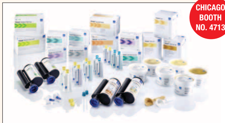
Kettenbach's Panasil family: 'Impressions done in one take use less material and cost less.'