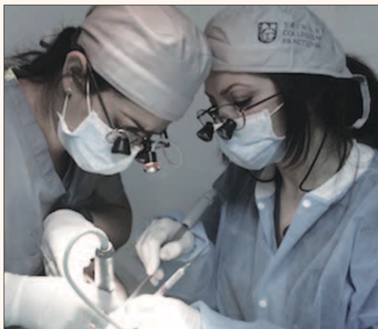
'Q-Implant Marathon' course participants.

• "Prior to coming to this course, I had only theoretical/didactic knowledge in implantology. You gain immense knowledge in placement, treatment planning and surgical skills. As a beginner, I would highly recommend tak-