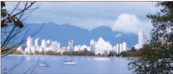
Vancouver, B. C., is host site of the annual Pacific Dental Conference.

The PDC Lab Expo, with a new look and direction, will be Saturday, March 11, bringing together dental techs, denturists, dentists and staffs. Expo attendees will be