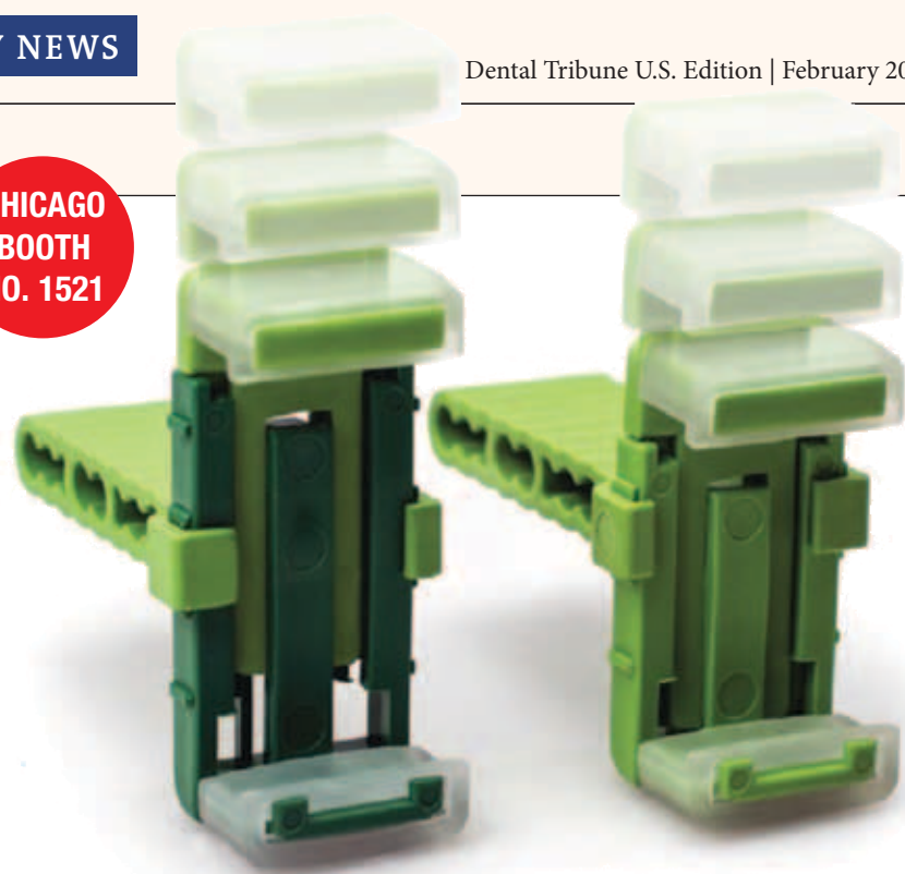
The Sensibles universal sensor positioner (large and medium sizes pictured,) now feature unique locking bumpers that enable you to slide the bite block to any of several fixed positions.