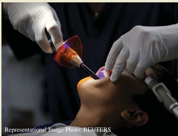
Representational Image

The Periodontology Department was established in KCD around 39 years ago. It has now been equipped with lasers, microsurgical instruments and Cone-beam computed tomographic (CBCT) equipment. This department provides basic periodontal treatments along with some advanced procedures such as implants, periodontal plastic surgeries, gummy smile corrections and guided tissue regeneration. In 2018, after a series of visits of the Pakistan Medical and Dental Council (PMDC) teams to the KCD medical teaching institute (MTI), its seats were enhanced from 50 to 80.