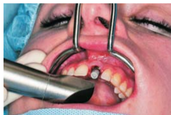
Fig. 10: Intra-op CEREC scanning with a ScanPost.