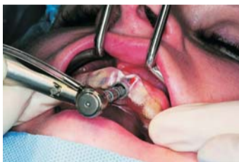
Fig. 9: Preparing the implant bed according to the recommended drill sequence, insertion of the implant using the SICAT surgical guide.