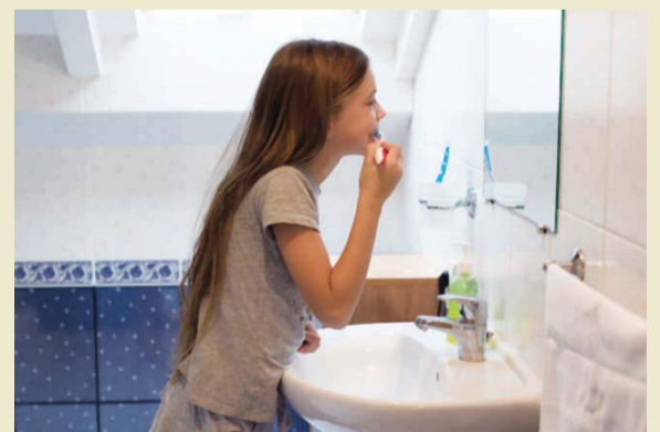
In a recent study, researchers in Germany have found, since a previous 2003-2006 report, the frequency of dental check-ups has increased.

B ERLIN, GERMANY - In a new study, researchers from the Robert Koch Institut (RKI) have examined, among other subjects, the prevalence, determinants and trends of tooth brushing frequency and utilisation of dental check-ups in children and adolescents in Germany. The reports are based on