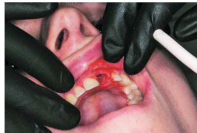
Fig. 7: Gentle extraction preserving the vestibular lamina.