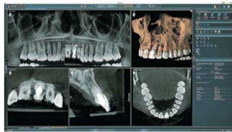
Fig. 3: The initial situation in 3-D in the Sidexis 4 imaging software (Dentsply Sirona) showed good apical bone substance with the possibility of immediate implantation.