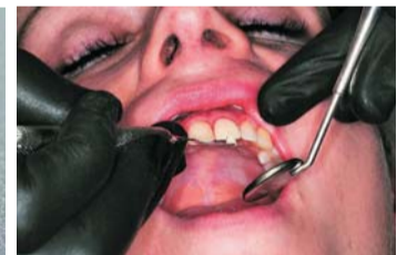
Fig. 13: Sealing the screw channel with composite.

every day because I have many patients who have busy jobs and do not have much time. I experience a great workflow in the practice that gives me maximum flexibility. Depending on the indication and the patient's wishes, I can decide whether to make the restoration myself or outsource it to a laboratory, which I often do for more elaborate bridges. Then, I send the scan directly to my partner laboratory via Sirona Connect—that is very reliable.