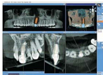
Fig. 6: The intraoral CEREC scan superimposed over 3-D image data for optimal positioning of the implant in the Galileos Implant planning software.