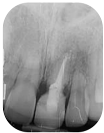
Fig. 1: Single-tooth exposure of tooth #21 after recurrent marginal gingivitis. Owing to the initial diagnosis of extensive resorption, the tooth could not be preserved.

When extracting tooth #21, it was important to preserve the vestibular lamina to allow immediate implantation. For this reason, the Sharpey's fibres were carefully severed with a periosteal elevator, and the tooth was gently removed (Fig. 7). The tooth had pronounced dentinal resorption, confirming the previously made diagnosis (Fig. 8). The SiroLaser Blue (Dentsply Sirona) with a wavelength of 970 nm was used to disinfect the alveolus. An OsseoSpeed EV 4.8–15 mm implant (Astra Tech Implant System, Dentsply Sirona) was inserted immediately using a surgical guide (SICAT OPTIGUIDE, SICAT; Fig. 9).