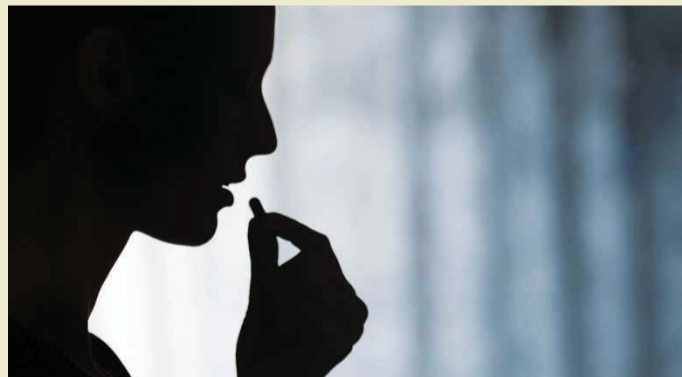
Instead of prescribing opioids, the American Dental Association believes that dentists should consider non-steroidal anti-inflammatory drugs as the first-line of therapy for acute pain management.

In March 2018, the ADA adopted a policy related to opioid prescription by dentists for acute pain. The policy supports mandatory continuing