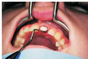
Fig. 11: Augmentation of the vestibular alveolus.