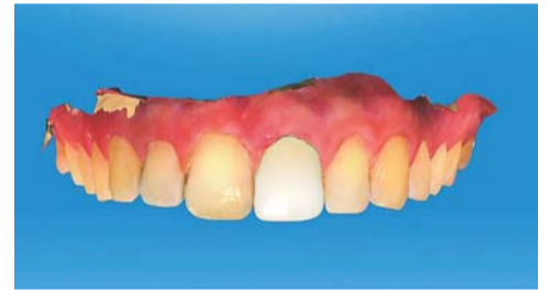
Fig. 4: Tooth #21 was deleted in CEREC to simulate the initial post-op situation.