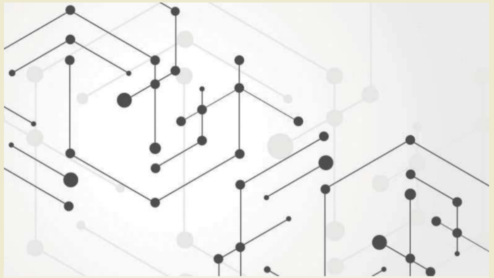
In a clinical trial, a UCLA-led team used biomaterials embedded with nanodiamonds—tiny gems to help tissue heal.

The researchers tested nanodiamond-embedded gutta percha (NDGP) in three patients who were undergoing root canal procedures. Tests