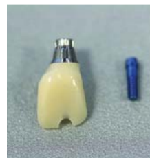
Fig. 12: The screw-retained crown as a finished polished temporary.