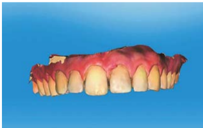
Fig. 5: The prosthetic proposal was also used as the basic file for producing the surgical guide with the gap at position #21.