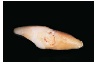
Fig. 8: The resorption of tooth #21, external view. This confirmed the accuracy of the diagnosis from the imaging procedure.