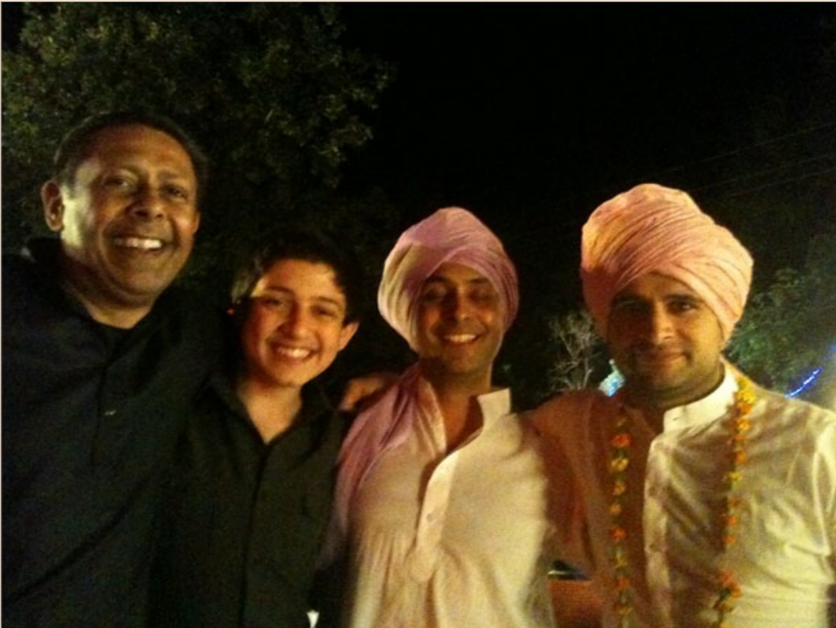
The Four Amigos

CAD/CAM SYSTEMS | INSTRUMENTS | HYGIENE SYSTEMS | TREATMENT CENTRES | IMAGING SYSTEMS