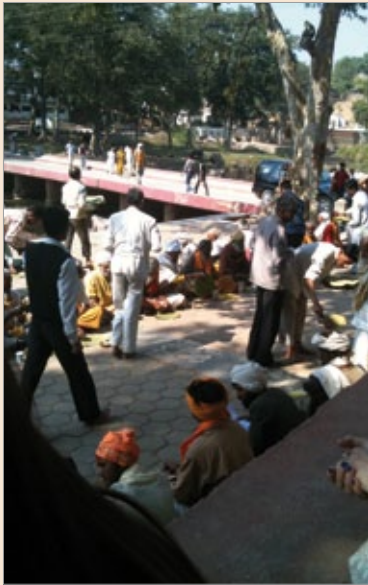
Feeding the Holy men

It is on the border between Madhya Pradesh and Uttar