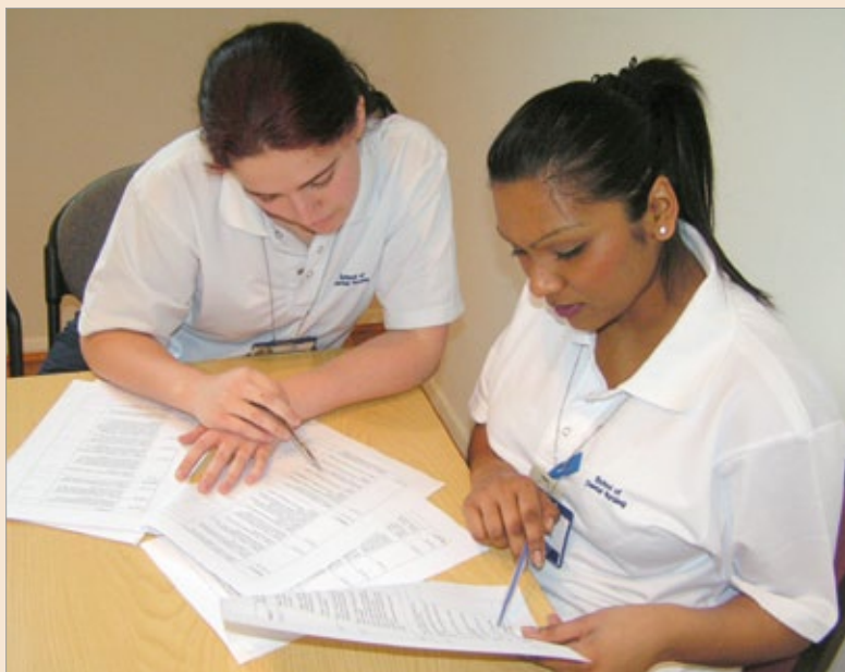
The proposed guidelines clarify the role of temporary registrants

The online questionnaire can be found at www.gdc-uk.org .