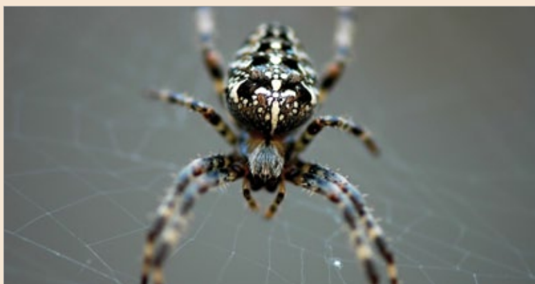
Visiting the dentist is seen as more scary than spiders

"The issue of anxiety affects everyone in the profession. Collectively we need to work together and we hope that the whole profession will get behind this year's National Smile Month campaign which starts on the 15 May 2011. The campaign offers the best opportunity for everyone to reach millions of people whose nerves and anxiety are directly affecting their oral health." DT