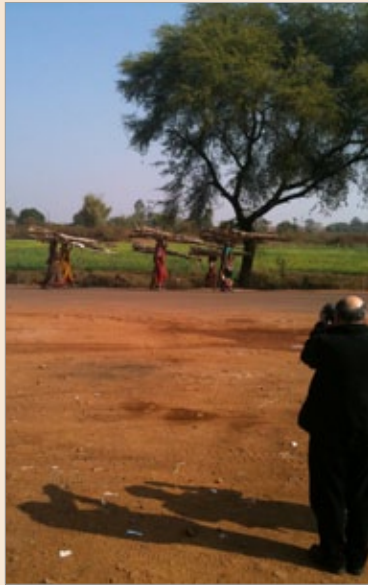
Women at work

Chitrakoot is best known as a major historic religious cen-