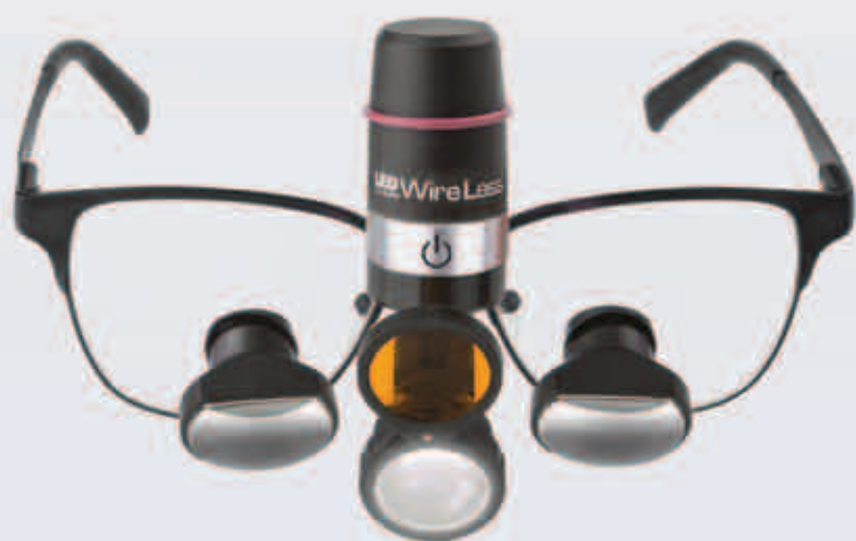
CLIPS ONTO YOUR EXISTING LOUPES shown here on NEW Steam frame

Totally WireLess Headlight - no wires, no battery pack