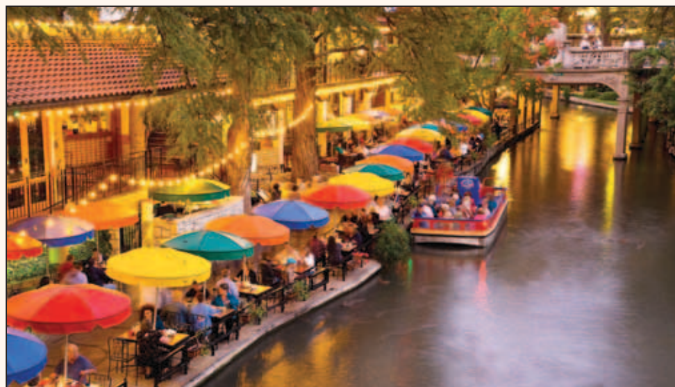
The American Academy of Pediatric Dentistry annual session will be from May 26–29 at the Henry B. Gonzalez Convention Center on San Antonio's highly popular River Walk.

Because attendees must register for the meeting prior to making meeting-block hotel reservations, attendees are encouraged to register early. There are a number of hotels in the AAPD block, including the Marriott Rivercenter (headquarters hotel), the Marriott Riverwalk, the Grand Hyatt San Antonio, the Hilton Palacio del Rio, the Residence Inn Alamo Plaza and the Westin Riverwalk. As you can tell from the hotel names, the convention center and hotels string the city's famed River Walk and