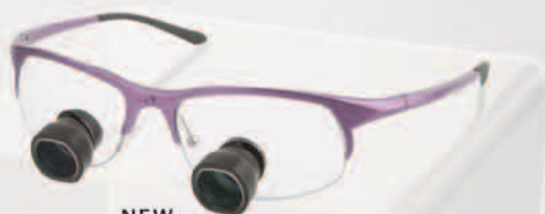
NEW Micro2.5x Scopes™