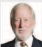
Stanley Malamed Anesthesia