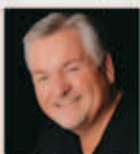
Steve Gilliland Communications