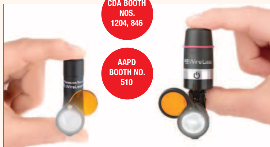
The new LED DayLite WireLess and the new LED DayLite WireLess Mini headlights can integrate with various platforms, including your existing loupes, safety eyewear, lightweight headbands and future loupes or eyewear purchases.

The LED DayLite WireLess is powered by a compact, rechargeable lithium-ion