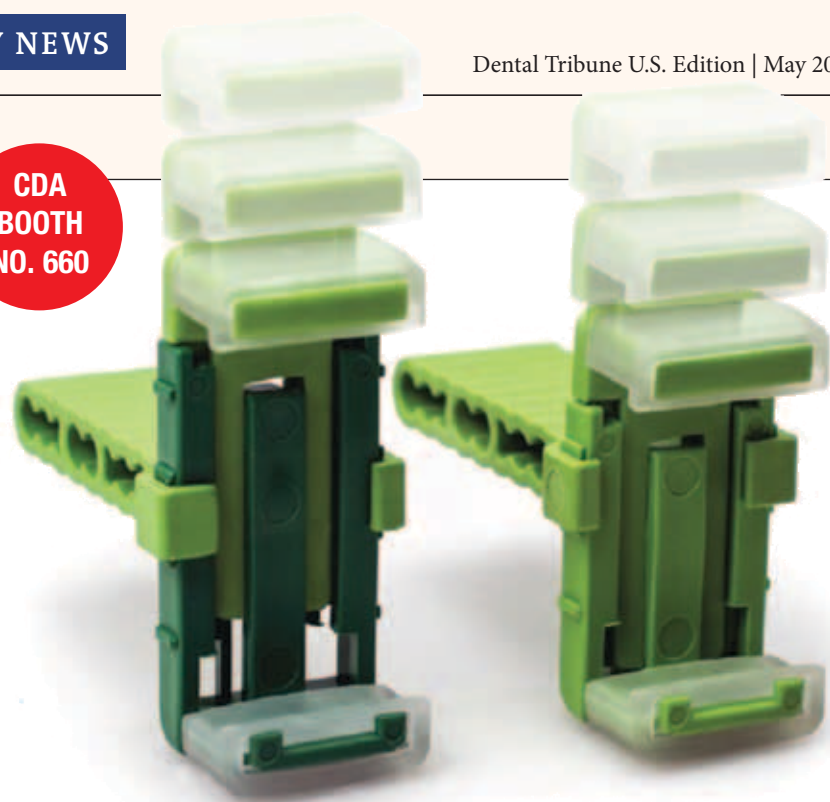
The Sensibles universal sensor positioner (large and medium sizes pictured) now feature unique locking bumpers that enable you to slide the bite block to any of several fixed positions.